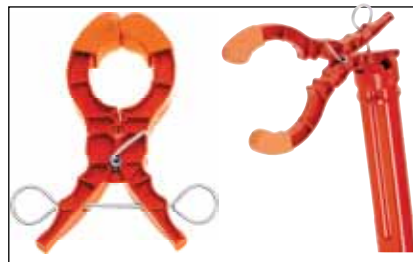
Hot Stick Clamp Catalog No. C4060531

Eyes and special handle shape for easy placement by clampstick