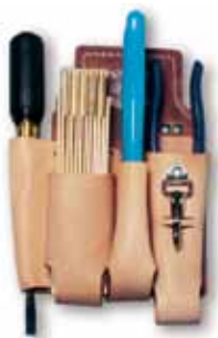
PS111HLS (Tools not included)