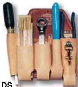
PSC111HLDS (Tools not included)

Bashlin manufactures only premium holsters for tool belts. They feature double backs which are reinforced for extra wear.