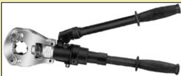
Versa Crimp® Hand operated Hydraulic Crimping Tool

Every Chance Hoist is proof-tested and factory-operated at 150% of capacity rating. Lightweight high-strength handle and sheave housings are heat-treated aluminum. All working parts are fully enclosed in the housing unit to protect the hoist mechanism and to cover the gearing for worker safety. Chain is high-strength alloy steel, polished for smooth action and low wear.