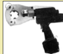
Versa Crimp® Battery Operated Crimping Tool