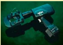
Versa Crimp® Battery Powered ACSR Cutter