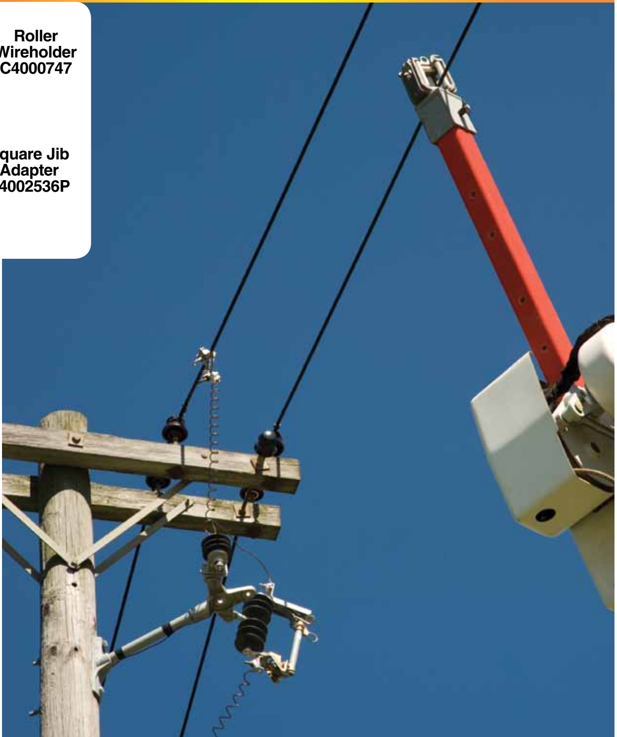
4" x 4" Epoxiglas® Jib Extension PST4002748

For detailed dimensions of products compatible with specific truck brands, please see Truck Accessories Section 4150 of the Chance® Hot Line Tool Catalog on our website: www.hubbellpowersystems.com . For products to fit truck brands not listed in the catalog, contact Hubbell Power Systems with detailed specifications.