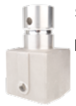
Square Jib Adapter P4002536P