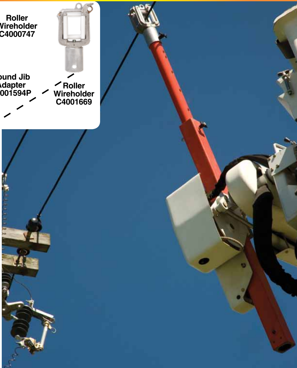
3"-diameter Epoxiglas® Jib Extension T4001525

This representative model fits Altec® trucks. To fit other brands of trucks, see selections in Catalog Section 4150.