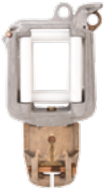
Roller Wireholder C4000747