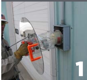
1 Positioning on residential meter