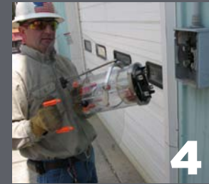
4 Meter removed from socket base

NOTE: The two black ball-type handles may be grasped if using Meter Claw without Safetyshield barrier.