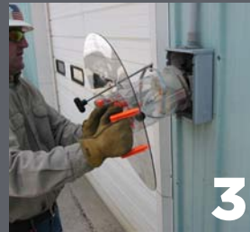
3 Removing/pulling meter