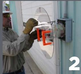
2 Closing non-conductive jaws with actuating rod