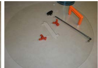
PSC4170642 Retrofit Kit for Meter Grabber by Utility Solutions includes shield, actuating rod with handle and two fasteners