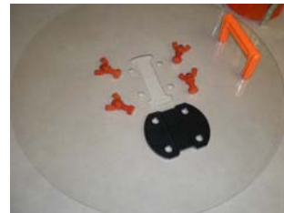
PSC4170641 Retrofit Kit for Meterpuller® by Rauckman Utility Products includes shield, adapter plate and four fasteners.