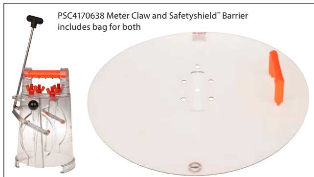
PSC4170638 Meter Claw and Safetyshield™ Barrier includes bag for both

NOTE: The two black ball-type handles may be grasped if using Meter Claw without Safetyshield barrier.